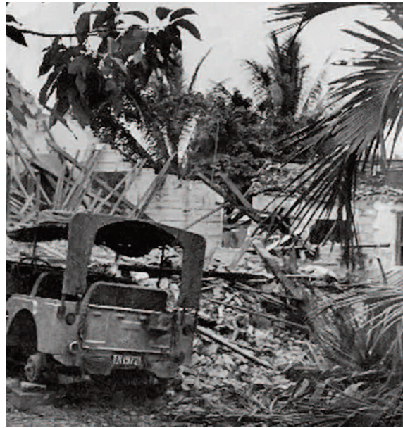
The Embassy House in Hue City after the Tet 1968 attack.

We looked out again and could see an NVA soldier scurry across the street with an RPG, and a couple seconds later, a second NVA followed carrying two rockets. I think the same